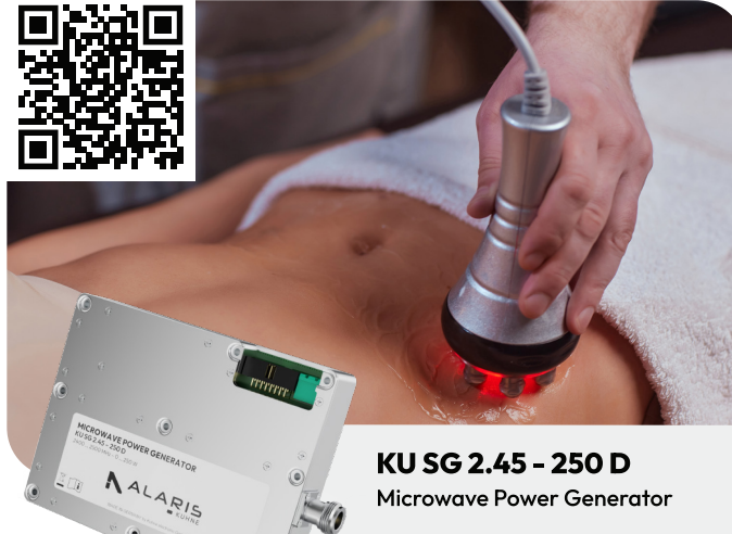
KU SG 2.45 - 250 D Microwave Power Generator