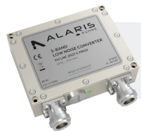
KU LNC 2027 C PRO2 Down Converter

Precision down converters and linearised power amplifiers with advanced predistortion technology deliver crystal-clear video and audio at any output level. Signal distortions are actively compensated, ensuring superior transmission quality regardless of distance, environment, or application.