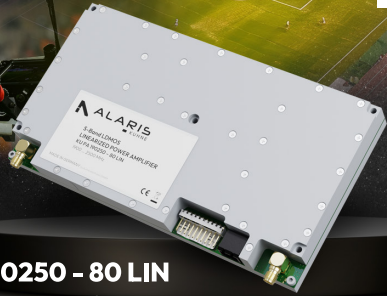
KU PA 190250 - 80 LIN LDMOS Power Amplifier