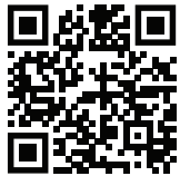
KU PA BB 070270 - 80 B Wideband Power Amplifier

Engineered for stable connectivity under interference, our systems safeguard data, voice, and video through advanced filtering and adaptive signal processing. Delivering robust performance, low latency, and operational security across tactical deployments and critical infrastructure alike.