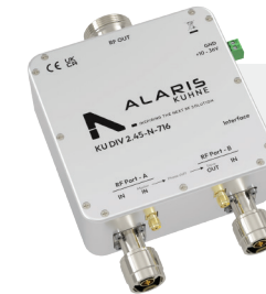
KU DIV 2.45-N-716 Power Combiner Kit 850 W