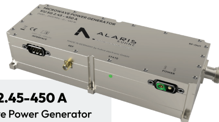
KU SG 2.45-450 A Microwave Power Generator