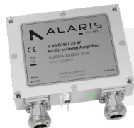
KU BDA 230250 - 25 A Bi-Directional Amplifier